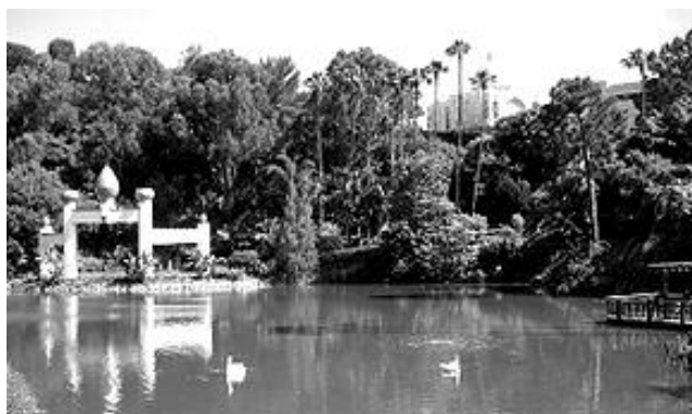
The Shrine’s gardens and natural spring-fed lake are home to a variety of flora and fauna.