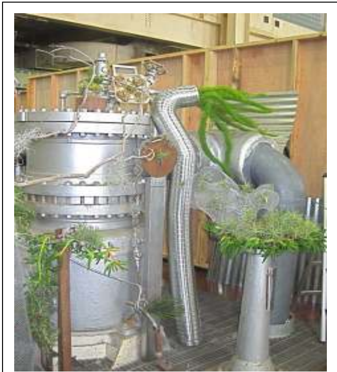
Power of Art “Industrial Green” by RGC